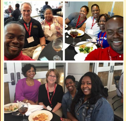
CASIE IB Training Summer 2016

King Middle was officially granted candidacy status as an International Baccalaureate (IB) school in June of 2016. Our teachers participated in IB professional learning during the summer of 2016. We will begin the implementation of the IB Middle Year Programme with a focus on the IB Learner Profiles, Inquiry Based Lessons, and IB Awareness.